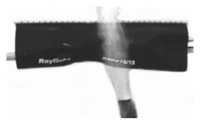
Continue heating evenly around sleeve from center to end until entire sleeve is recovered